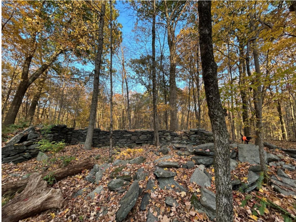
Collins Preserve

Until a few days ago, the crickets were still chirping, but it was clear that change was on its way. Fall is a quiet time in the woods, and the once-background ring of crickets comes to the foreground as other sounds drop away, and everything quiets in preparation for winter. As the ferns senesce to a pale yellow, the quality of the light changes, and the smell of mildewing leaves drifts up from the ground. The sun is still warm, but the light streams in at a weaker angle.