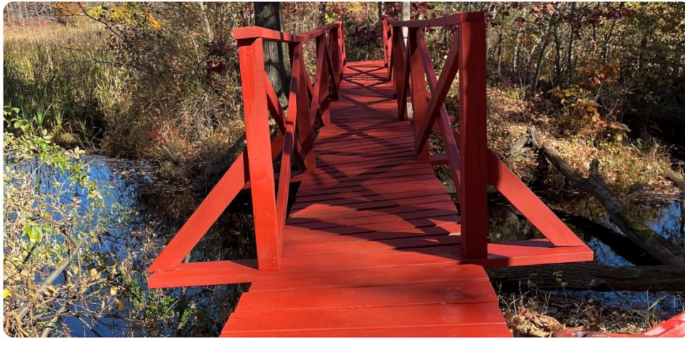
The bridge: before and after